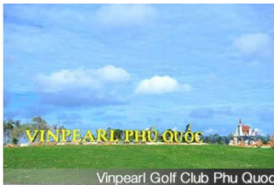
Vinpearl Golf Club Phu Quoc