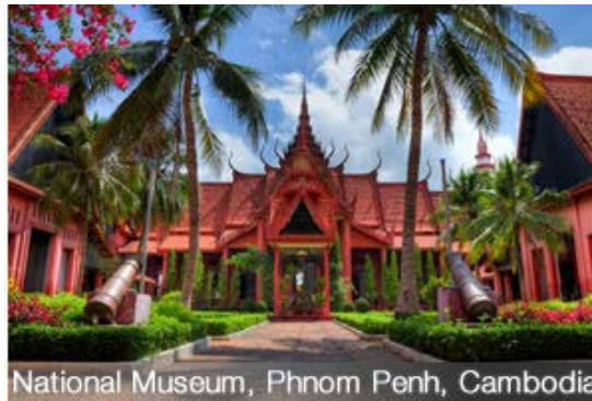
National Museum, Phnom Penh, Cambodia