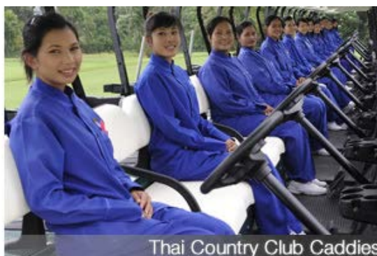
Thai Country Club Caddies

Thailand (10): Golf in Thailand equals service. Thai hospitality is some of the world's best and the Thai