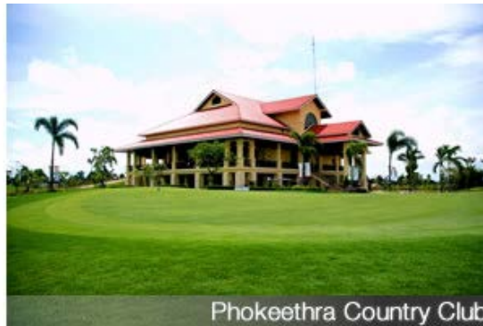
Phokeethra Country Club

[Read more about one of Cambodia's Best Golf Courses]