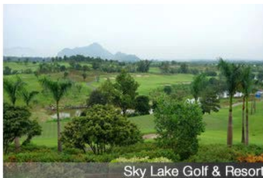
Sky Lake Golf & Resort