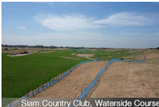
Siam Country Club, Waterside Course

Pattaya: You might think 45 holes of championship golf would be enough for one golf complex, but Siam Country Club does not rest! The new Siam Country Club Waterside Course will feature a friendlier golf course as compared to its Old Course and Plantation Course big brothers. The new Waterside 18 will play around 3 large lakes and a creek that meanders through the course on a relatively flat piece of land. Design by IMG and construction by Golf East (same as Banyan Golf Club, Hua Hin) practically ensures success for the opening of the Waterside Course in March 2014. Stayed tuned for more project updates as things progress at Siam Country Club!