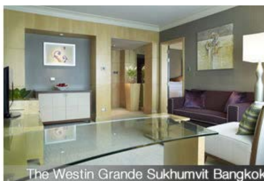
The Westin Grande Sukhumvit Bangkok

[Read more about one of Thailand's Best Hotels & Resorts]