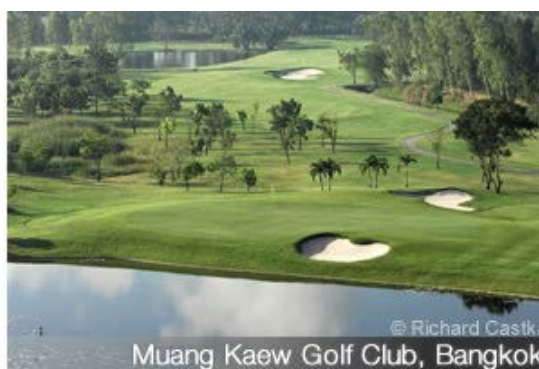
Muang Kaew Golf Club, Bangkok

[Read more about one of Thailand's Best Golf Courses]