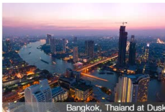
Bangkok, Thailand at Dusk