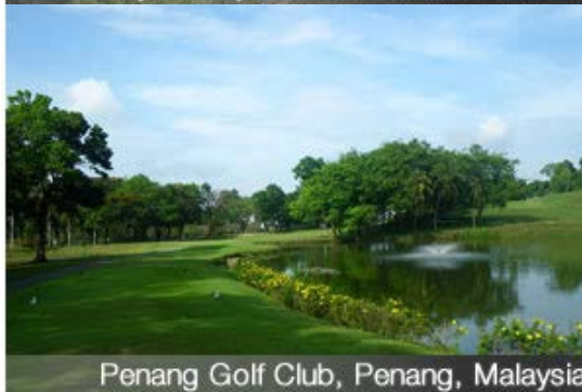
Penang Golf Club, Penang, Malaysia