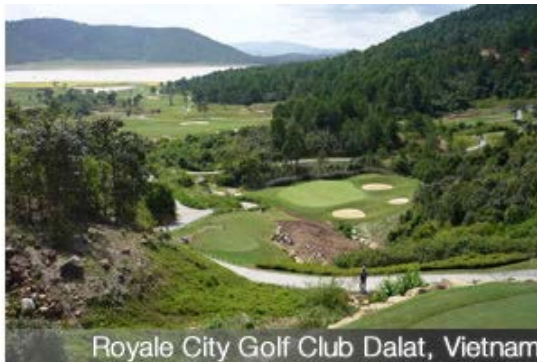
Royale City Golf Club Dalat, Vietnam

Penang: You might not have heard of this island, but it is one of my favorite golf destinations in Malaysia. Being a UNESCO World Heritage Site since 2008, Penang was one of the 3 original Chinese settlements in Malaysia (the other 2 were Melaka and Singapore). Some of the best sites of Penang include the sandy beaches, the landscape from the summit of Penang Hill (next to Penang Golf Club), Penang's many flea and spice markets, and the quaint nooks and crannies of Georgetown; the former British settlement on the mainland. Now, in an all-out effort to confuse golfers, the top ranked Bukit Jambul Golf & Country Club changed name to Penang Golf Club. So, there is Penang Golf Club (on Penang Island) & Penang Golf Resort (on the mainland). Why not give both a try; at least you won't be at the "wrong" Penang golf course? Moreover, adding Penang into a golf package is easy as there are direct flights from Bangkok, Kuala Lumpur, and Phuket.