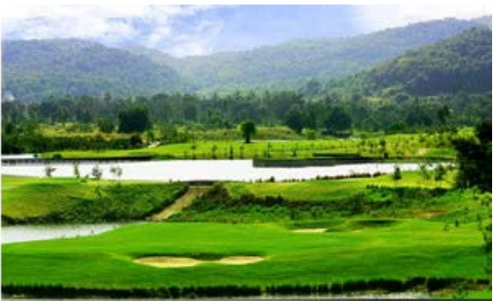
Silky Oak Country Club, Pattaya