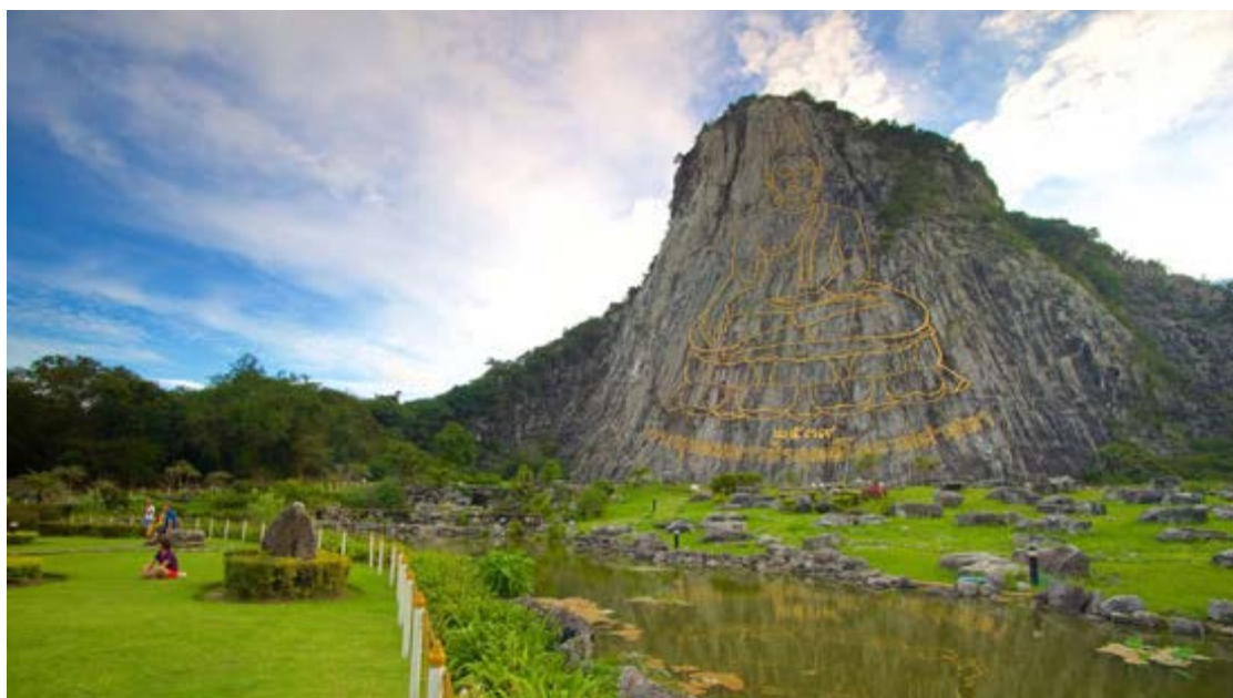
CHEE CHAN MOUNTAIN GOLF RESORT

Over the last few years Pattaya golf has seen a steady increase in course selection. This trend continues as Thailand's newest premium quality course is readying for an early 2018 opening. Chee Chan Mountain Golf Resort which was formerly referred to as "The Master" is being constructed in the shadows of the Buddha etched into the mountain which bears the same name and is visible from every hole on the golf course. Grassing and clubhouse construction are ongoing at a slow but steady pace. Designed by Golfplan, Chee Chan Mountain will also mark the re-introduction of IMG golf course management back to Thailand. I look forward to the course opening and reporting on the progress.