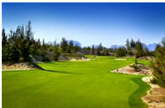
BRG DANANG GOLF RESORT

The last time I fell asleep on a flight I was travelling from Bangkok to Saigon. To my amazement when I was woken up by the flight attendant while descending into Tan Son Nhat International Airport, I was pleasantly greeted by the sight of a brand new golf course. That was 4 years ago and