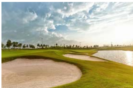
THAN SON NHAT GOLF COURSE