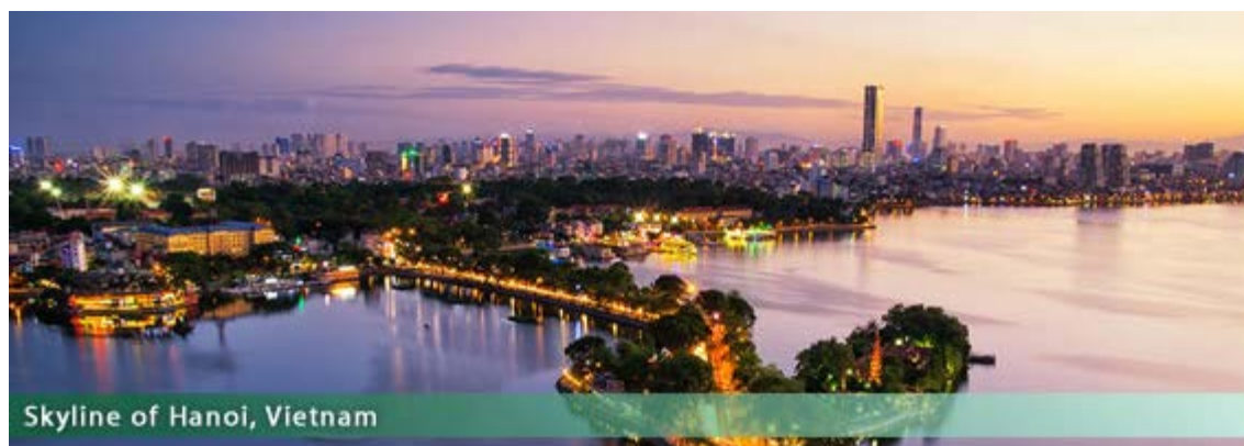
Skyline of Hanoi, Vietnam

Hanoi is Vietnam's capital and the country's second largest city. The city is a fascinating blend of east and west, with Chinese influence from centuries of dominance and French design from its colonial past. When Hanoi opened its door to the outside world following the adoption of the 1986 reforms, golf remained a sport tagged with a 'four-letter' word. Party officials frowned on golf as an irrelevant bourgeois indulgence. Now however, golf is enjoyed by locals and visiting golfers alike. Hanoi sports many championship courses the best of which include Van Tri , Sky Lake , Tam Dao , Chi Linh Star , and Kings Island .