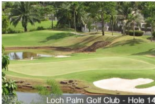
Loch Palm Golf Club - Hole 14

Phuket: Taking advantage of the low season, Loch Palm Golf Club is undertaking some cosmetic course improvements. One of the aims is to improve drainage in the approach areas to the greens. Pictured is the signature 14th, a great downhill hole with panoramic views over Phuket Island.