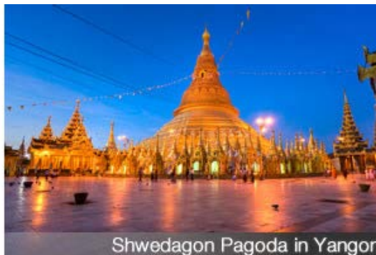
Shwedagon Pagoda in Yangon