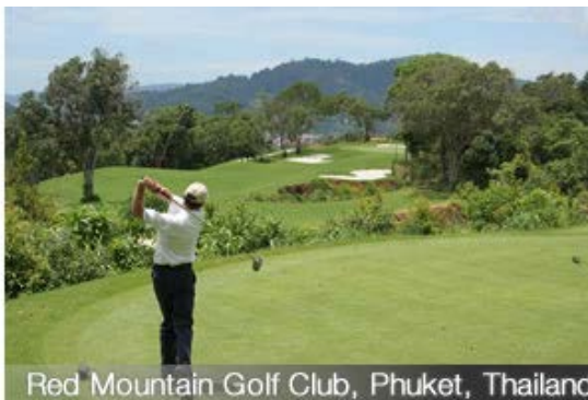
Red Mountain Golf Club, Phuket, Thailand

For more golf tips visit www.golftthink.com