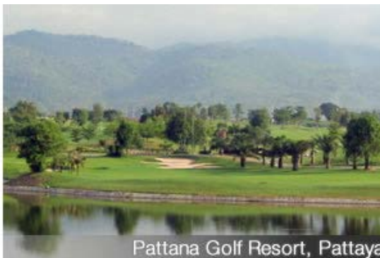
Pattana Golf Resort, Pattaya

Pattana is a bit out of the way as getting to the course involved around a 1 hour drive from Pattaya or 2 hour ride from Bangkok. Either way the drive is pleasant enough as the road are good and there is little traffic along the way. Upon arrival I immediately saw the large club house, golf resort, and collection of golf villas. With this kind of infrastructure Pattana must be catering for long staying golfers and those looking for intensive stay and play packages.