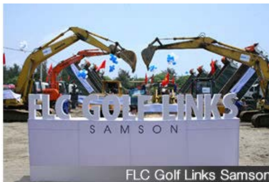
FLC Golf Links Samson

Hanoi: In an about face and during a slow market, FLC Golf Links Samson in Thanh Hoa Province and around 4 hours from Hanoi has broken ground. Once completed, FLC Golf Links will be the second Nicklaus designed course in Vietnam, the first being Legend Hill also in Hanoi. A full international 5-star resort will be part of the golf complex and completion is expected in 2016. The 18-hole golf course will cover an area of 92.49 hectares. The land plot is located along the coast and on Sam Son beach.