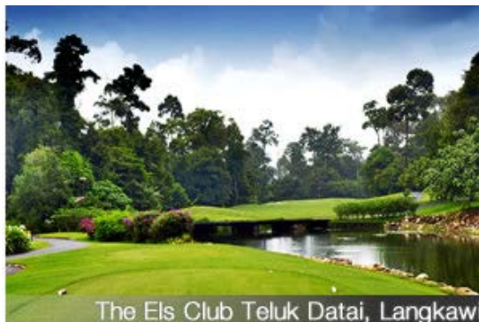
The Els Club Teluk Datai, Langkawi

Langkawi: Re-design work by the team from South African golfing legend Ernie Els transformed the former Datai Golf Club into a modern first-class venue and the recently re-opened Els Club Teluk Datai has been named South East Asia's Best Golf Course at the 2014 Asia-Pacific Property Awards held in Kuala Lumpur. This in itself is amazing as the course is barely open for 2 months and the judging must have taken place when the course was still closed! In any case, the Langkawi course will now go on to represent Asia-Pacific at this year's International Property Awards in Dubai. The layout will compete against other regional winners from Africa, the Middle East, Europe, United Kingdom and the Americas at the awards ceremony to find the 'World's Best Golf Course'.