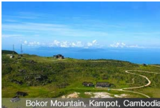
Bokor Mountain, Kampot, Cambodia