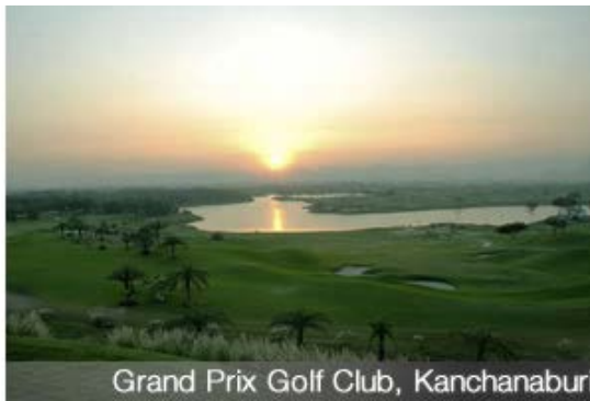
Grand Prix Golf Club, Kanchanaburi