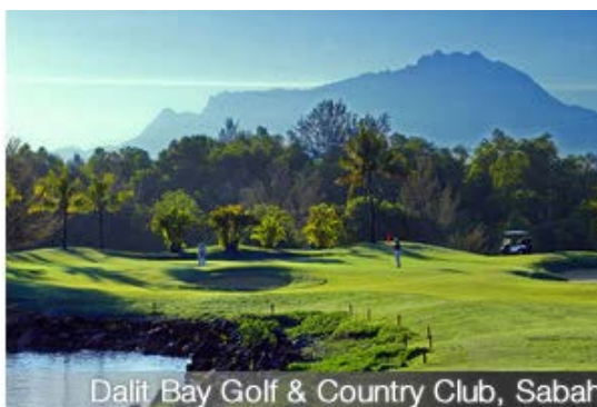
Dalit Bay Golf & Country Club, Sabah

Besides the beautiful sights Kota Kinabalu also offers great golf, designed by world renowned golf architects. Choose from one of the luxurious selections of hotels and play golf at one of the popular courses. [ Kota Kinabalu Golf Tour Detailed Itinerary... ]