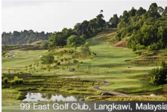
99 East Golf Club, Langkawi, Malaysia