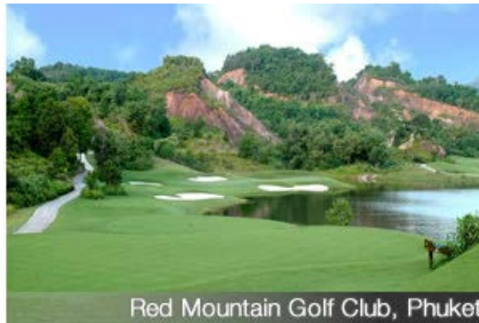
Red Mountain Golf Club, Phuket

Date: March 10 - 16, 2013 | Location: Pattaya, Thailand