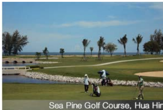
Sea Pine Golf Course, Hua Hin