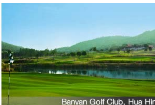
Banyan Golf Club, Hua Hin

The attendees are meeting with 140 golf tour operators and specialist golf travel agencies from 39 countries including key markets in Asia, Europe, Australia, and the Americas. [ Read the entire Press Release ]