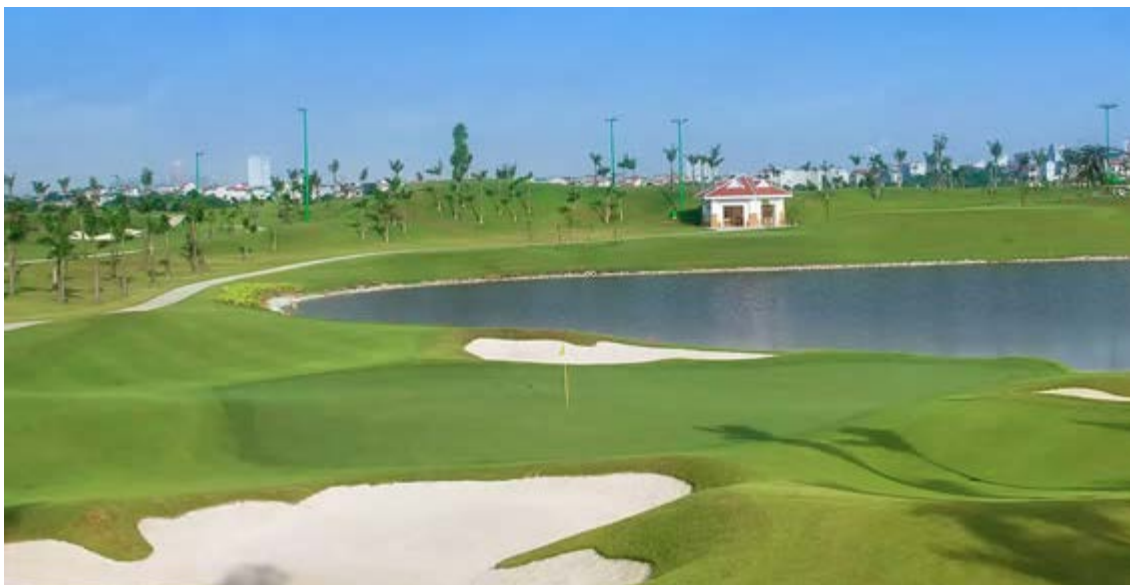
LONG BIEN GOLF COURSE, Hanoi, Vietnam

Long Bien Golf Course has expanded to 27-holes. The additional 9 designed by Nelson Hayworth are a perfect match with the original 18 and together all 27 have the best playing surfaces in Hanoi. The central location is perfect to minimize commutes and the clubhouse is modern and so large it can accommodate 5 Indian weddings, at the same