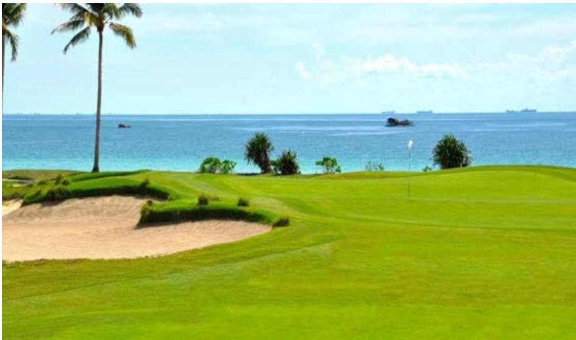
LAGUNA GOLF BINTAN, Bintan, Indonesia