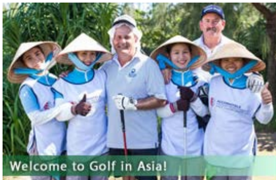
Welcome to Golf in Asia!

Welcome to the latest issue of the Asian Golf Nation, the source for news breaking information about golf in Asia. In addition, unique golf playing tips for South East Asia's tropical environment, announcements of golf travel promotions, and our latest tournament offers are all parts of this newsletter.