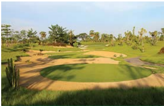
BANGKOK AT NIGHT