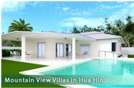
Mountain View Villas in Hua Hin

run developer has constructed high quality residences all around the world since 1889.