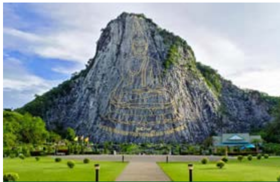
THE MASTER GOLF RESORT

MasterCard has just cited Bangkok the top-ranked tourist destination with 21 million arrivals projected for this year. Bangkok also has some of Asia's best golf courses, such as the two year old Nikanti Golf Club , a one-of-a-kind unique 18-hole track, situated in Nakhon Pathom province west of Bangkok. The capital is a great stopover as part of a dual-centered golf holiday . Other popular golfing destinations such as Pattaya & Hua Hin are only a 1.5-3 hour drive from the city.