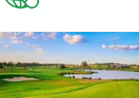
The Emerald Hubs of Golfing in Asia