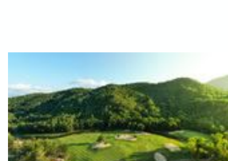
Ball - The Island of Golf